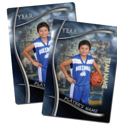
19 - PHOTO MAGNETS (SET OF 2) feature player's name, team name & year