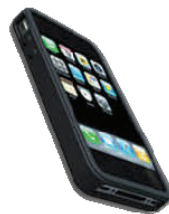
23 - CELL PHONE PHOTO CASE iPhone & Samsung Galaxy cases available - specify make/model on front