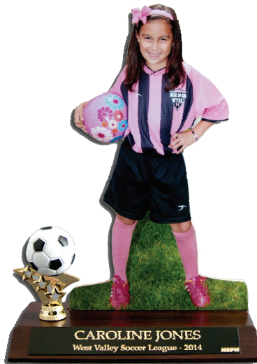
17 - JUMBO STATUETTE includes laser engraved plate w/ player's name, team & year and sports figure