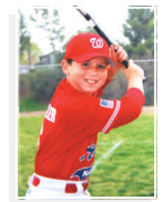
30 - ACRYLIC MAGNET FRAME photos not included - holds your wallet photo