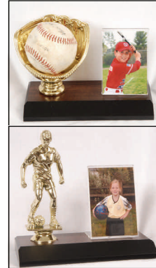
11 - SPORTS DESK FRAME - holds your wallet photo & includes gold figure for sport (glove for baseball/softball)