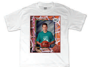
25 - PHOTO T-SHIRT features player's name, team name, sport & year