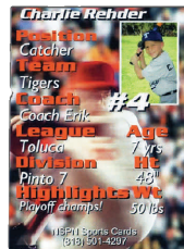
18 - TRADER CARDS (SET OF 18) feature player's full stats! Customized template for your sport