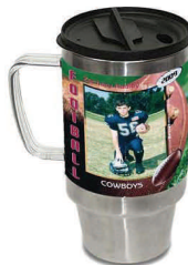
22 - STAINLESS STEEL PHOTO TRAVEL MUG features player's name, team name, sport & year