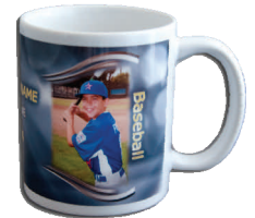
20 - CERAMIC PHOTO MUG features player's name, team name, sport & year