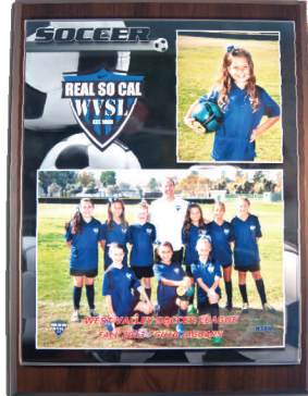
9 - 9x12 CHERRYWOOD PLAQUE with your 8x10 Memory Mate print mounted onto plaque