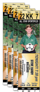
27 - STADIUM TICKETS (Set of 4) include player's name, team & year. Just like real tickets!