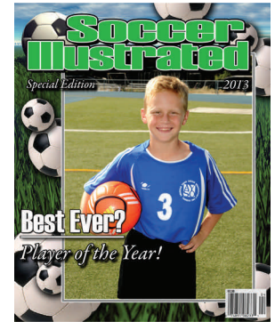
13 - 8x10 MAGAZINE COVER PHOTO - customized for your sport!