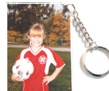
29 - ACRYLIC KEYCHAIN FRAME photos not included - holds your wallet photo