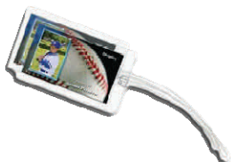
26 - BAG TAGS (SET OF 2) feature player's name, contact phone number, team name & league