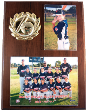
8 - 9x12 DELUXE CHERRYWOOD PLAQUE includes gold sports logo & extra team & individual photos to fit inside acrylic covers

customerservice@nationwidephoto.com P: (818) 501-4297 F: (818) 501-4299 13600 Ventura Blvd. Sherman Oaks, CA 91423 www.nationwidephoto.com