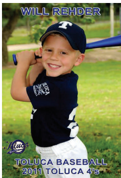
15 - 20x30" POSTER PRINT customized with player's name, league, team, year & league logo